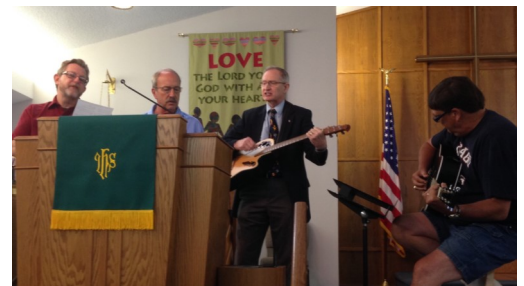
The Men's "Mixed Up" Chorus performed Harry Chapin's "Cat in the Hat".

Join us at New Hope on Sundays at 9:30am in the Ruby Chapel. Group discussions are based from "The Wired Word" that weaves current events into the Bible study.