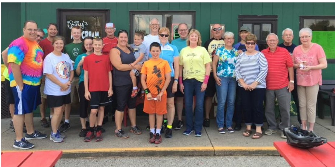
The bike crew and support team that made the trip to Billy's Ice Cream on August 6th!